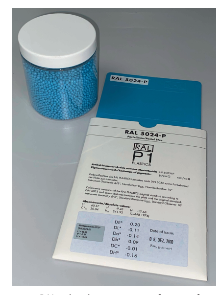
Fig. 2. RAL color charts serve as references for the analyses.

As the proportion of recycled materials in packaging increases, so do the imposed quality requirements. Consist-